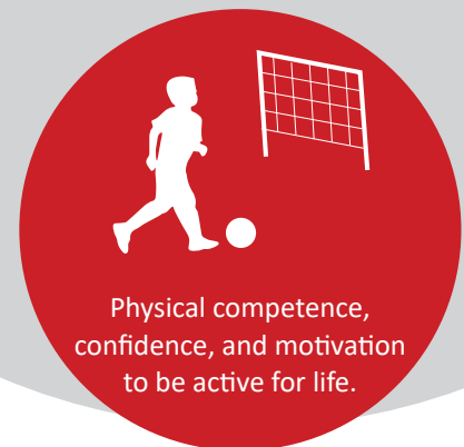
Figure 4: Physical Activity and Physical Literacy

because fundamental movement skills are a key component of Physical Literacy