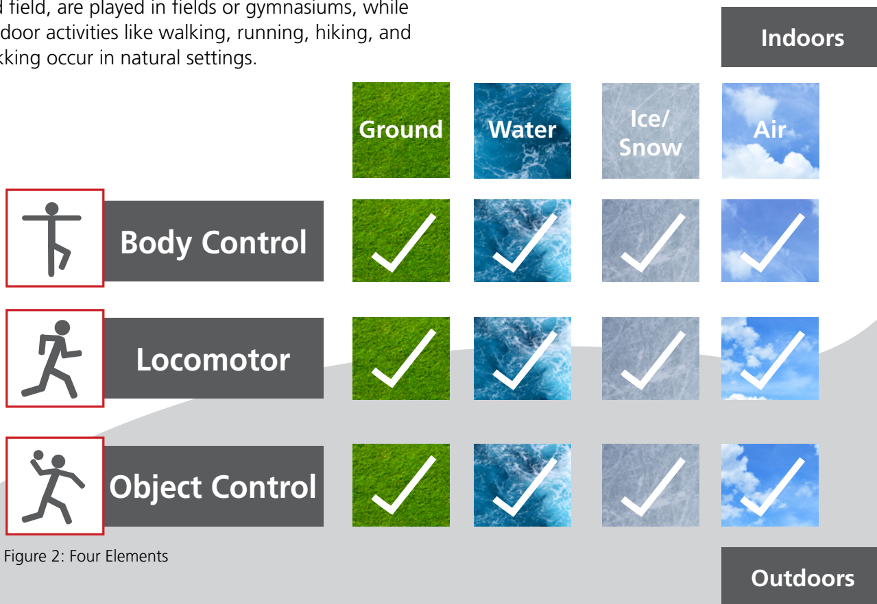
Figure 2: Four Elements

Experiencing diverse environments develops a broader skill set, ensuring Canadians can engage in physical activities in any context for life.